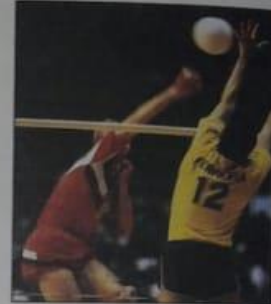
2. VOLLEY BALL